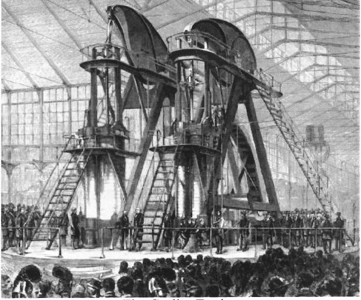
The Corliss Engine

"The Centennial introduced ten million visitors to exotic peoples and their culture – and impressed on every one of the visitors an indelible image of the United States as a nation come of age. Nothing else so gloriously captured the American Spirit of '76 as 1876! We were a proud people as we celebrated our one-hundredth birthday." <sup>1</sup>