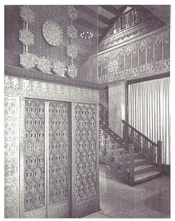
Elevator doors in the Guaranty Building