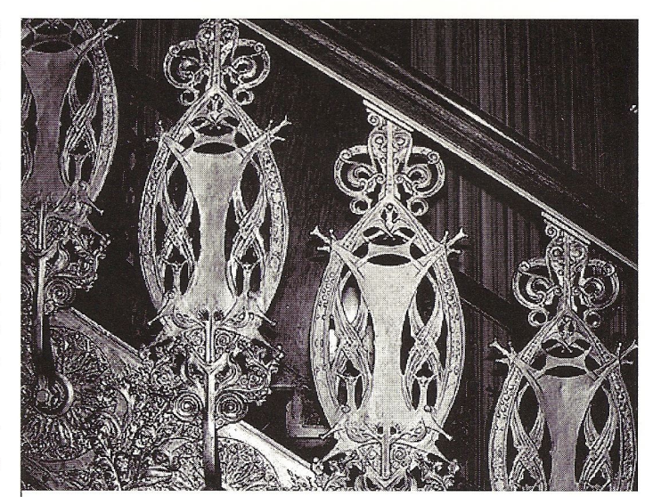
Staircase in the Guaranty Building