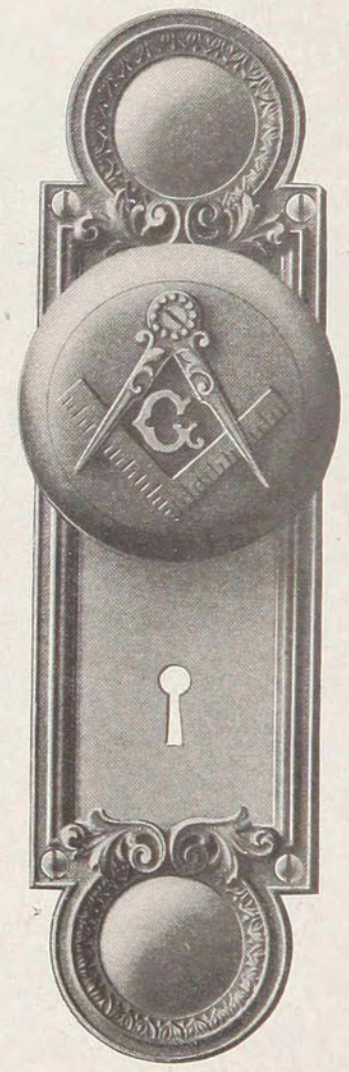
Knob No. S 143 2\frac{1}{4} in. Esc. No. 89731 2\frac{1}{4} \times 8\frac{3}{8} in.