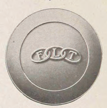
No. S 2026 2\frac{1}{2} in. No. S 2027 2\frac{1}{4} in.