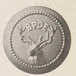
No. S 3227 2½ in.