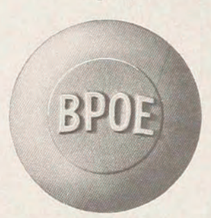
No. S 3240 2\frac{1}{4} iu.