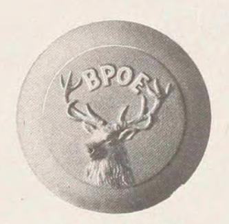
No. S 3656 2¼ in.