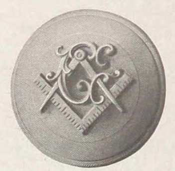
No. S 142 2½ in.