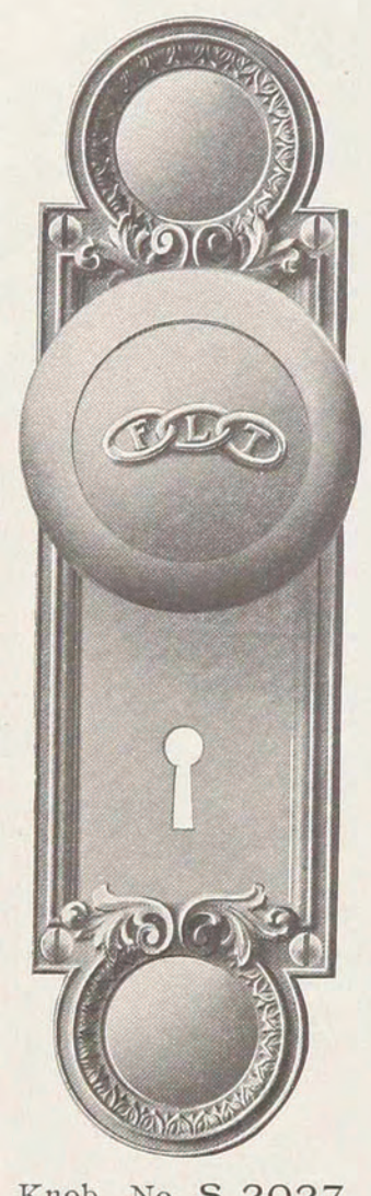
Knob No. S 2027 2\frac{1}{4} in. Knob No. S 2026 2\frac{1}{2} in. Esc. No. 89731 2\frac{1}{4} \times 8\frac{3}{8} in.