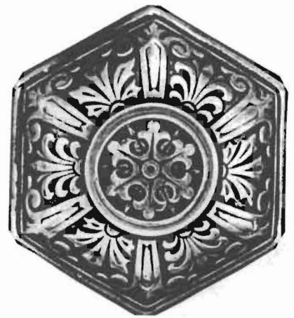
METALLIC COMPRESSION CASTING CO. (RUSSELL & ERWIN) CAST BRONZE PAT. JUNE 7, 1870, DESIGNER: JOSEPH A. RUFF