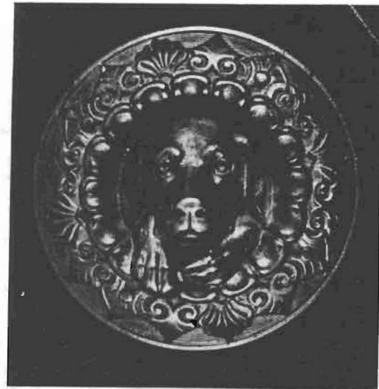
"HOUND DOG" BY METALLIC COMPRESSION CASTING CO. (RUSSELL & ERWIN) PATENT JUNE 7, 1870 DESIGNER: LUDWIG KREUZINGER