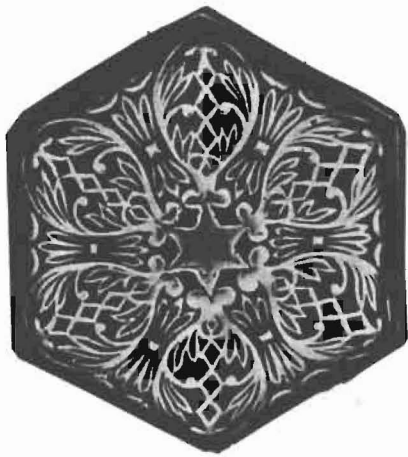
MALLORY WHEELER, CAST BRONZE "STAR" 1882 CATALOG PG. 262