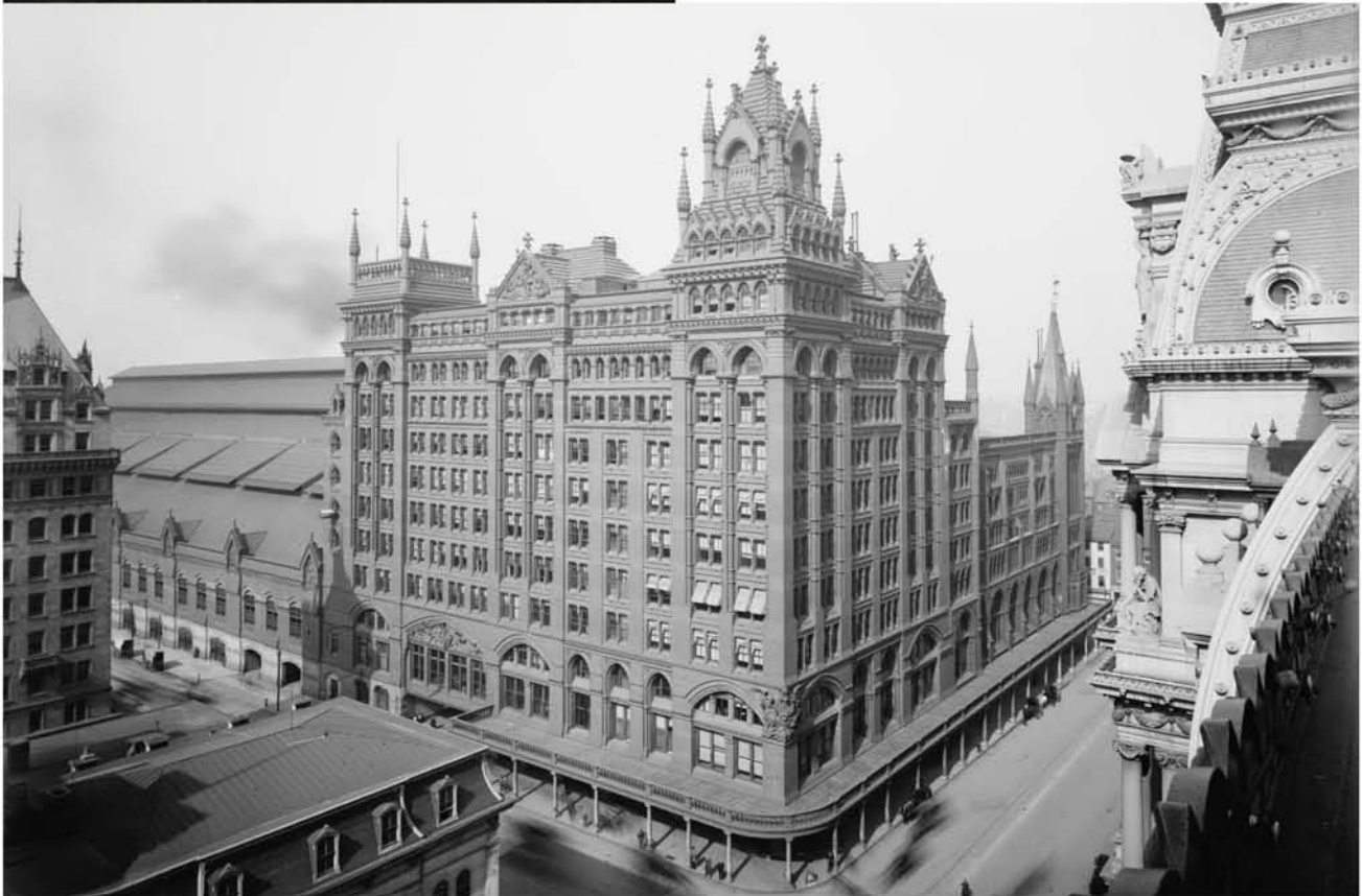
Broad Street Station, with the 1881 station at center right and the 1893 station at center. City Hall is seen at the right edge of the photo.

The Pennsylvania Railroad built their Philadelphia station just west of City Hall in 1881 to designs by the Wilson Brothers. In 1893 architect Frank Furness more than doubled the size of the original station, with twelve tracks extending from the Schuylkill River to the station atop a “Chinese Wall” which divided this section of the city into two parts. The 1893 station housed the administrative headquarters for the railroad in grand Victorian splendor, along with a grand waiting room and services expected from one of the largest and most profitable railroads along the east coast. The hardware was manufactured by Chicago Hardware Company in bronze with a custom PRR monogram (VDA O-179). The station served the railroad until 1933 when a new station was built at the Schuylkill River. Railroad offices remained at Broad Street Station until 1952, when the building was closed. The station was demolished in 1953, replaced by Penn Center which includes some five million square feet of commercial space, becoming the new business center for the city.