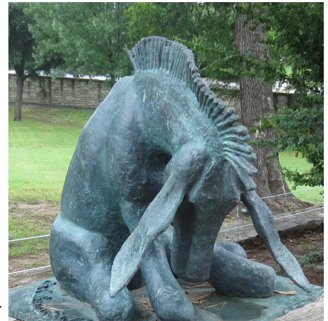
The sculpture at the French Legation was sad to see us leave Austin.