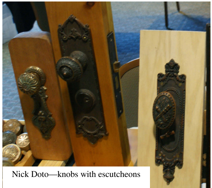
Nick Doto—knobs with escutcheons