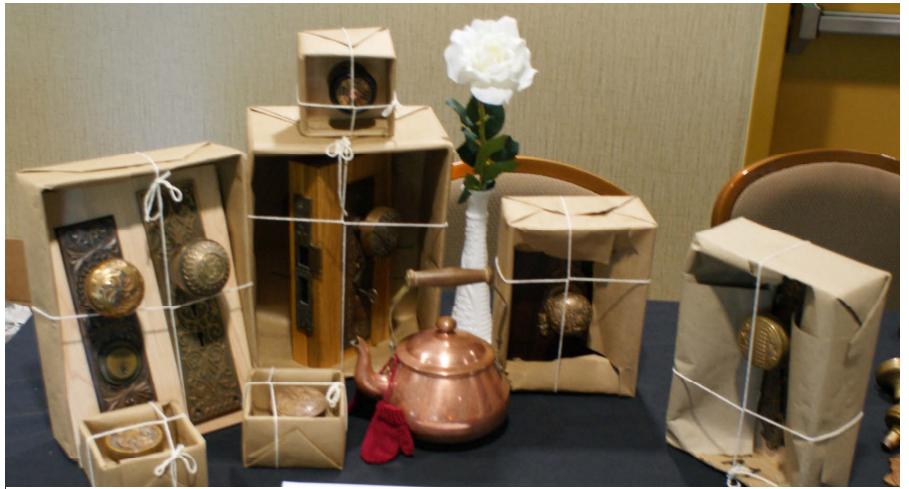
Steve Hannum—brown paper packages tied up with sting