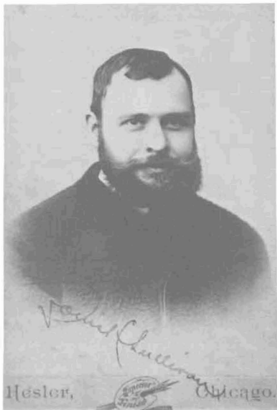
Louis H. Sullivan, 1891.

Louis H. Sullivan was born September 3, 1856, in Boston, Massachusetts, into an artistic family. During the early 1870s, Sullivan studied architecture at the Massachusetts Institute of Technology (MIT) and at the Ecole des Beaux-Arts in Paris. In 1875 Sullivan moved to Chicago, where he worked as a freelance designer and draftsman. Sullivan became a principal in the architectural firm Adler & Sullivan in 1883. During the next twelve years, he designed some of the period's most important commercial buildings and private residences for clients in Chicago, St. Louis, Buffalo, Seattle and other cities nationwide. After Dankmar Adler dissolved the business partnership in 1895, Sullivan continued to seek building commissions throughout the Midwest. Most of these were more modest structures, like small-town banks, in contrast to the dramatic skyscrapers he had previously designed. In his later years, Sullivan wrote extensively on his philosophy of architecture. He died in Chicago on April 16, 1924.