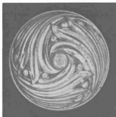
Yale & Towne, 1894 School, "Romanesque"

Louis H. Sullivan was born September 3, 1856, in Boston, Massachusetts, into an artistic family. During the early 1870s, Sullivan studied architecture at the Massachusetts Institute of Technology (MIT) and at the Ecole des Beaux-Arts in Paris. In 1875 Sullivan moved to Chicago, where he worked as a freelance designer and draftsman. Sullivan became a principal in the architectural firm Adler & Sullivan in 1883. During the next twelve years, he designed some of the period's most important commercial buildings and private residences for clients in Chicago, St. Louis, Buffalo, Seattle and other cities nationwide. After Dankmar Adler dissolved the business partnership in 1895, Sullivan continued to seek building commissions throughout the Midwest. Most of these were more modest structures, like small-town banks, in contrast to the dramatic skyscrapers he had previously designed. In his later years, Sullivan wrote extensively on his philosophy of architecture. He died in Chicago on April 16, 1924.