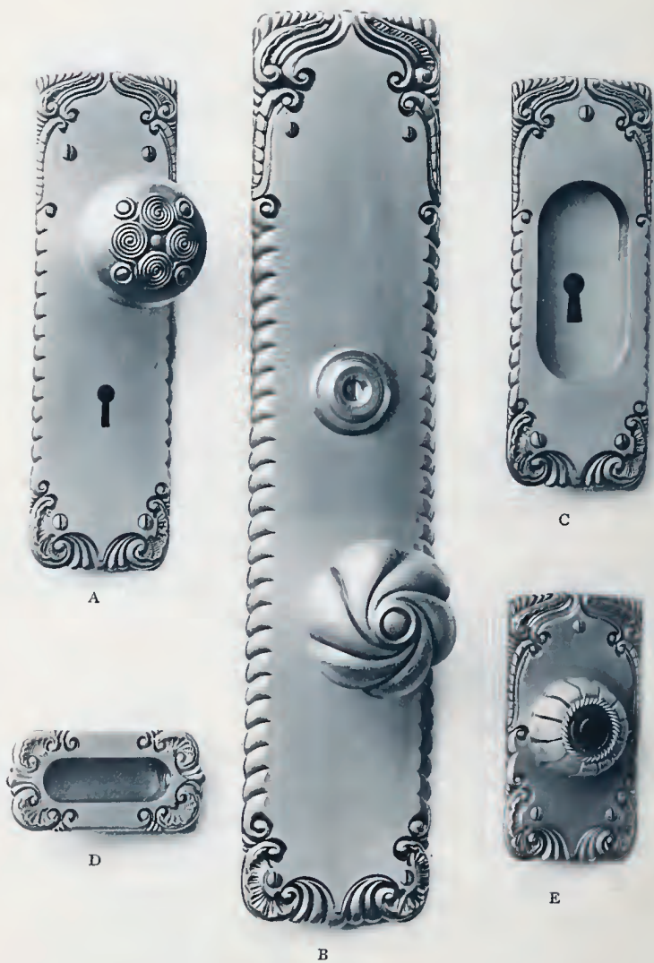
A — Knob No. 437 Escutcheon No. 1983 B — Knob No. 652 Escutcheon No. 1981