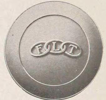
No. S 2026 2½ in.