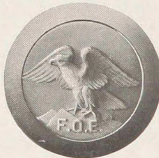
No. S 3658 2½ in.