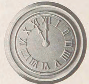
No. S 3940 2¼ in.