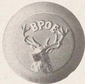
No. S 3656 2¼ in.