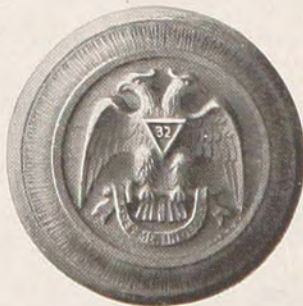
No. S 2406 2½ in.