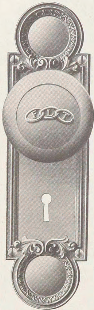
Knob No. S 2027 2 \frac{1}{4} in.