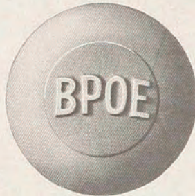
No. S 3240 2¼ in.