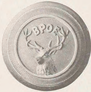
No. S 3655 2¼ in.