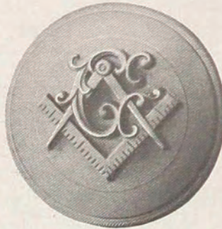
No. S 142 2½ in.