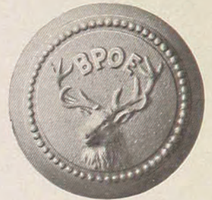
No. S 3227 2¼ in.