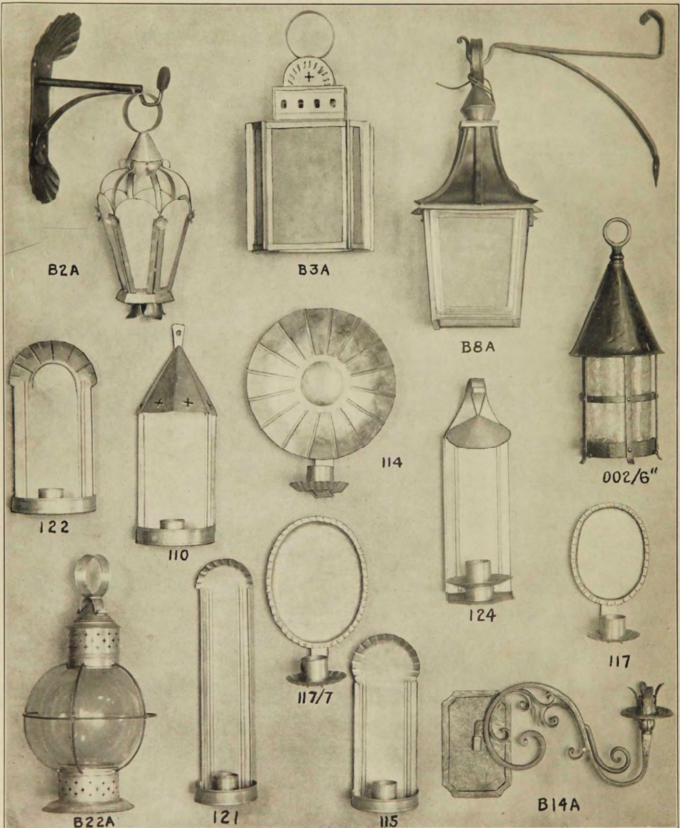
Showing the various sizes of Sconces, Lanterns and Wall brackets, which are made in Tin, Copper, Pewter, Brass and Iron.