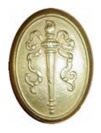
N-20510 Sargent & Co.