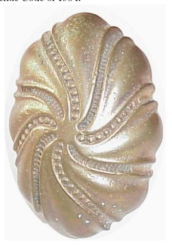
N-17500 Russell & Erwin