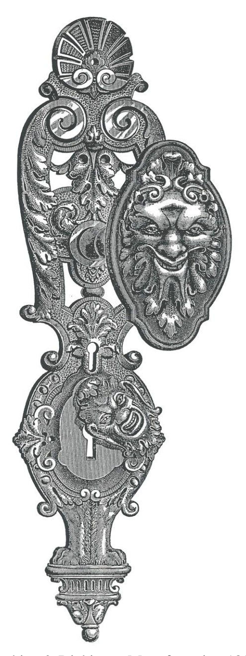
Hopkins & Dickinson Manufacturing 1890