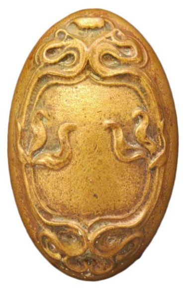
N-13400 Sargent & Co.

ADCA does not currently manage endowment funds, but ADCA will manage any endowment type of gift or bequest so as to preserve the corpus of the assets given and manage the assets so as to provide perpetual income for ADCA activities such as those listed above. Such endowment assets shall be considered "permanently restricted."