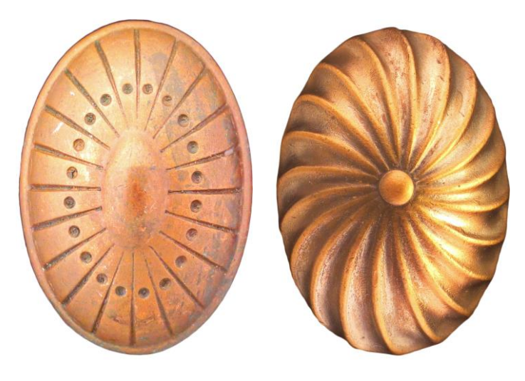
N-22500 Russell & Erwin N-15200 Phoenix Lock Works