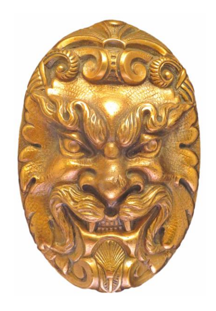
A-32620 Hopkins & Dickinson