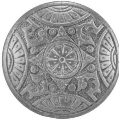
H-24310 Norwich Lock Manufacturing