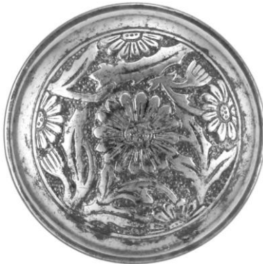
B13000 U.S. Steel Lock Company