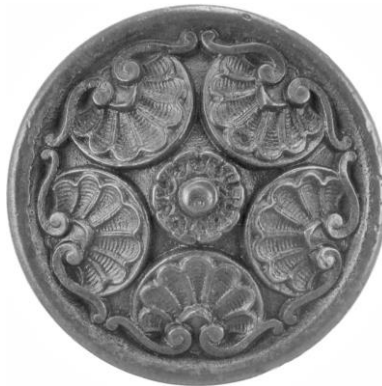
I-10600 Quincy Reading Hardware