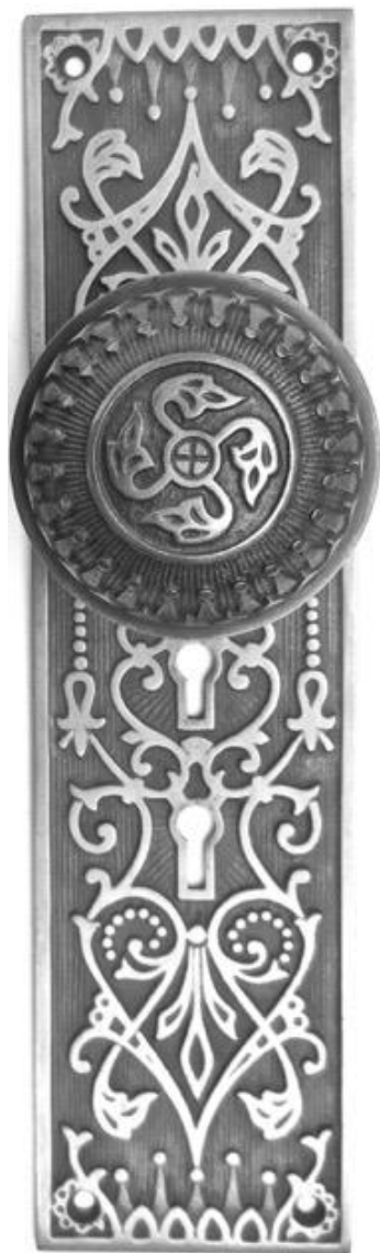
H-21000 Taylor & Boggis Foundry Cleveland, Ohio