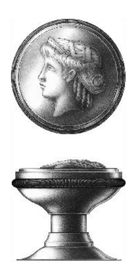
E.R. Butler & Co.