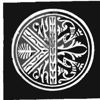
"Egyptian" by Branford